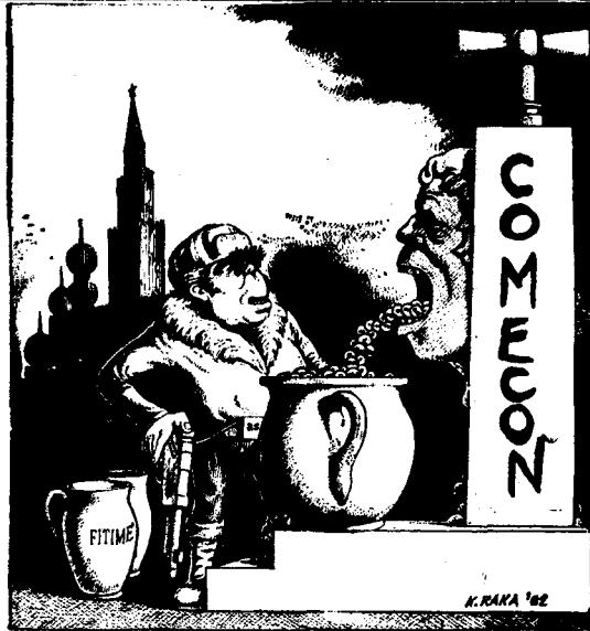
From 'Drita' -- PSRA.

Although the superpowers have a great economic and military potential and try to pose as if they are invincible, reality shows the opposite. The history of the latest decades provides numerous examples of the triumph of the peoples in their just