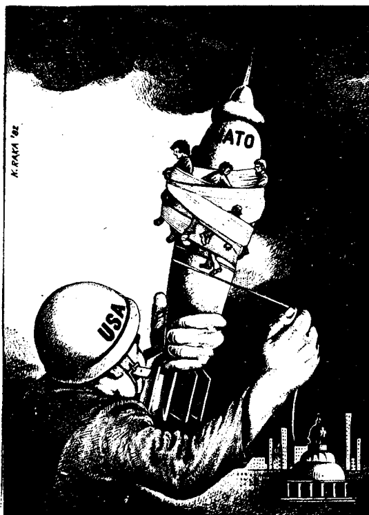
From 'Drita' - PSRA