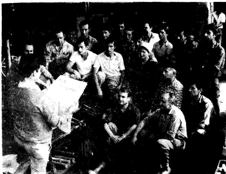
Workers in Albania studying 'Zeri i Popullit'- newspaper of the Party of Labour of Albania.

The pamphlet explains that : "In Albania the working class is in power. It has the political power in its hands and under the guidance of its Party of Labour, it sets the tone for the entire life of the country. This leading role is sanctioned in the Constit-