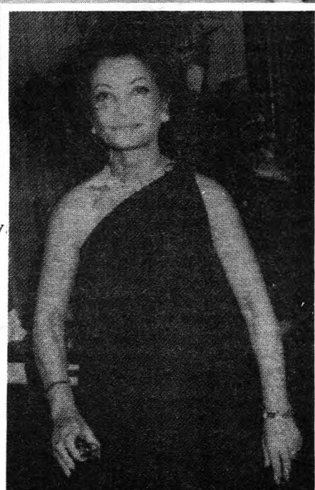
Gen. Nguyen Ngoc Loan, the Saigon chief of police who was personally responsible for the murder of thousands of Vietnamese people during the war; Shah of Iran and the rest of Pahlavi family who have been responsible for murder of hundreds of thousands of people throughout their filthy lives-- 30,000 in 1978 alone-- are the kind of people the U.S. government gives refuge to in the U.S. This is an insult to the dignity of the American people.