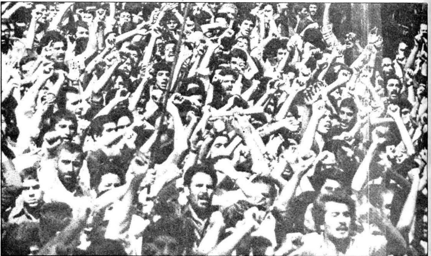
Demonstrations like this one in Tehran in September 1978 led to the overthrow of the fascist Shah’s US-backed regime.

The traitor regime of the Shah, in order to guard the interests of its foreign masters, and with their help, is engaged in its daily effort of equipping its anti-people armed forces with sophisticated weaponry, the armed forces which has no duty other than the repression of the struggle of our people, and the peoples of the region. For this reason, the toiling masses of our people, in order to overthrow the Shah’s regime, have no choice other than destroying