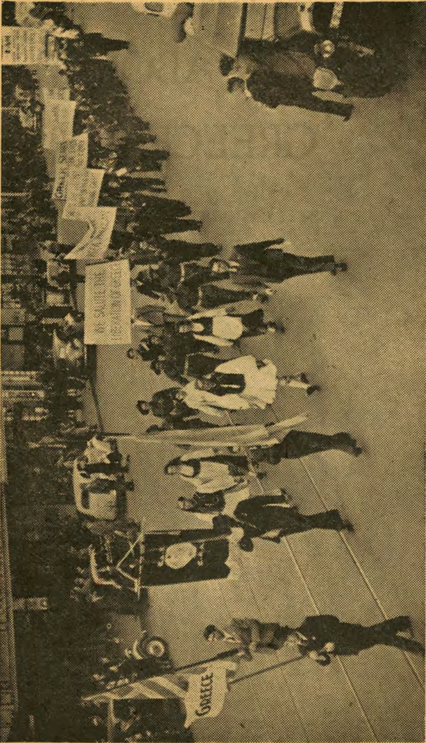
Members of the Greek community in Melbourne march through the city in support of the Greek Liberation Movement. These citizens have a proud record as democrats and fighters for liberty.