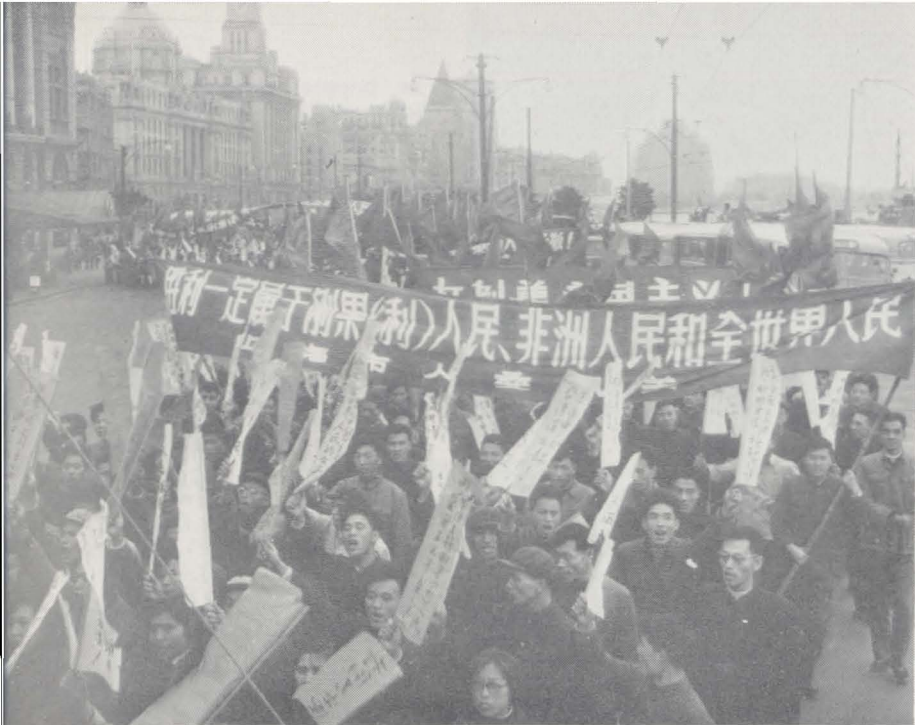
People of all walks of life in Shanghai hold a great demonstration