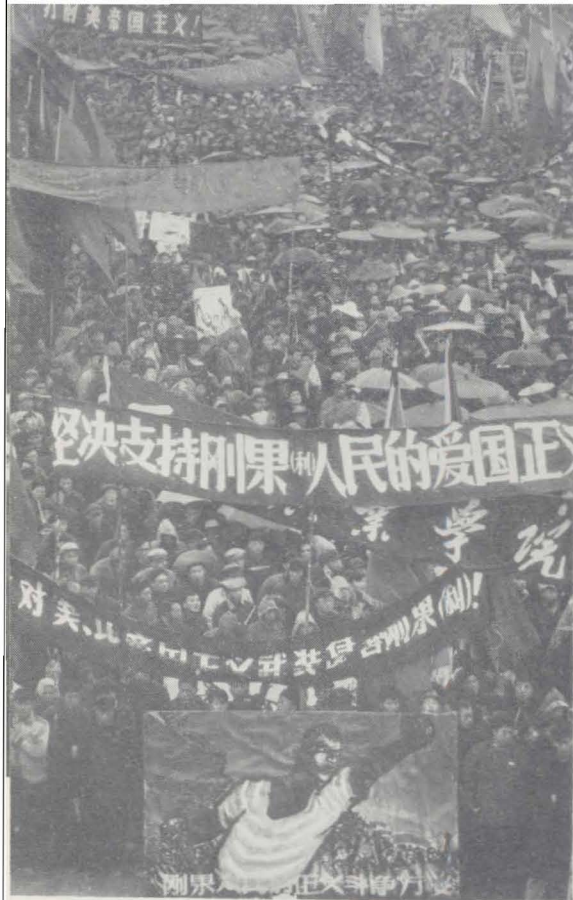
Militia of various nationalities in Kunming express their indignant protest