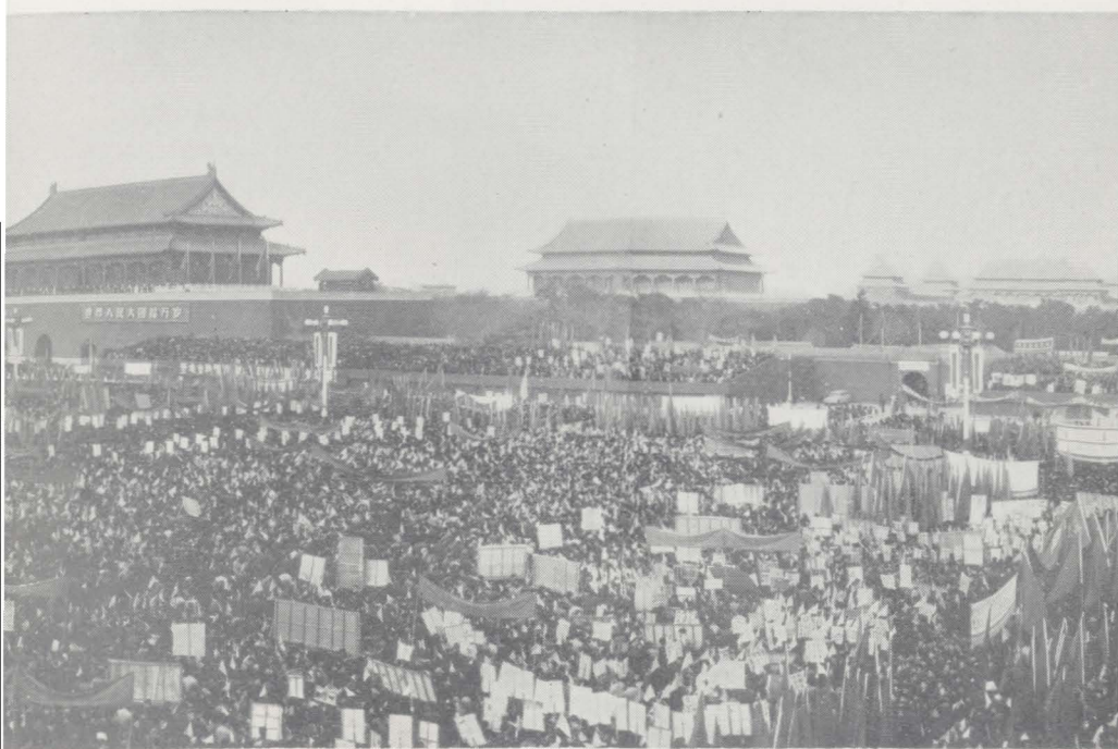
700,000 demonstrators gather at Tien An Men Square and indignantly condemn the U.S.-Belgian imperialists' crime of armed aggression in the Congo (L)