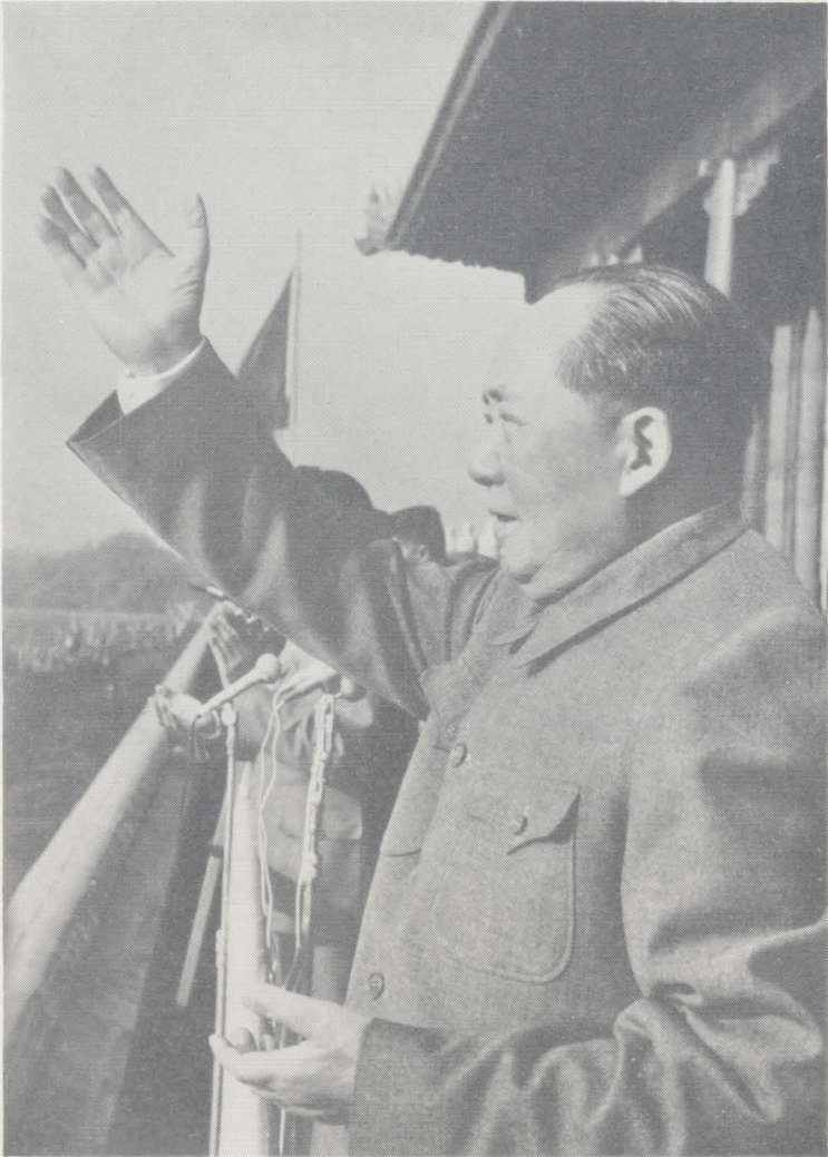
Chairman Mao Tse-tung waves to the demonstrators from the Tien An Men rostrum

On November 29, 1964, people of all walks of life in Peking, capital of the People's Republic of China, held a massive rally and demonstration in support of the struggle of the Congolese (L) people against U.S.-Belgian imperialist armed aggression