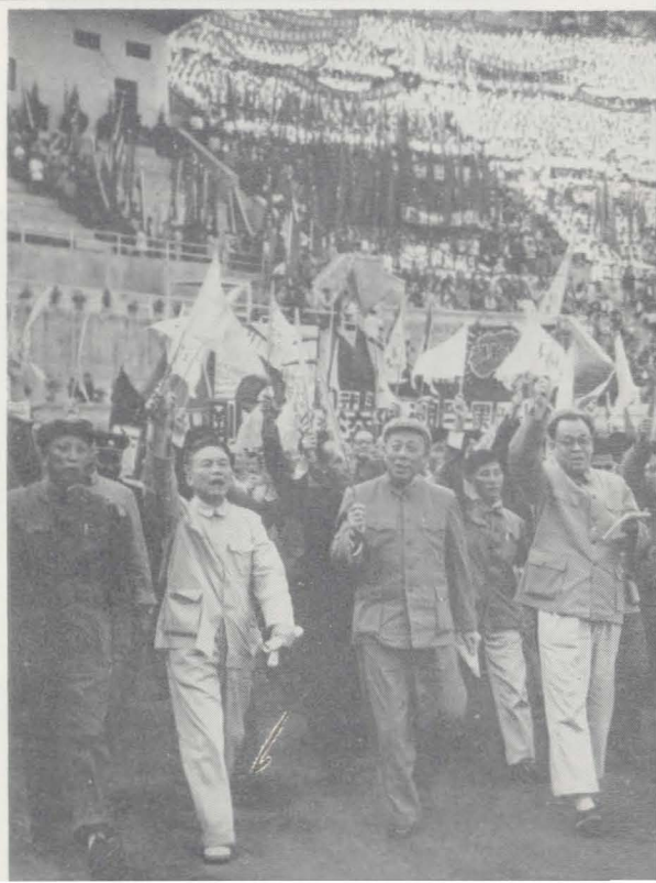
A large-scale gathering and demonstration in Canton. Chen Yu (third from left), Secretary of the Secretariat of the Central-South Bureau of the Central Committee of the Chinese Communist Party and Governor of Kwangtung Province, and other leaders head the parade