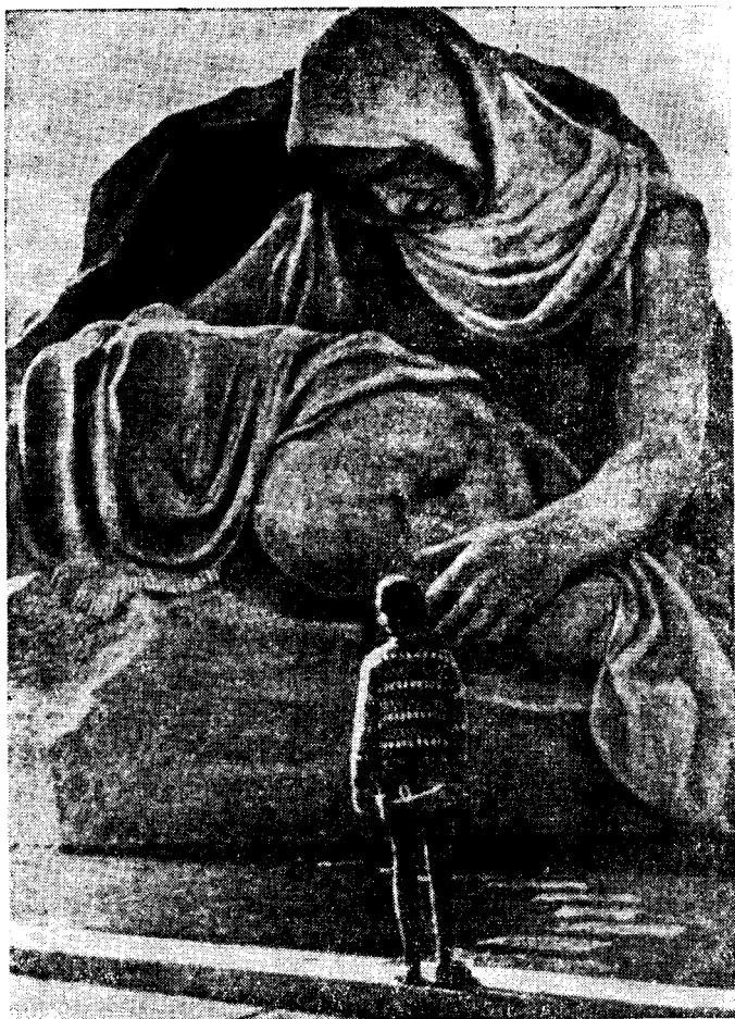
Sculpture of a "distressed mother" on the "Monument to the Heroes" who fell in the Battle of Stalingrad.