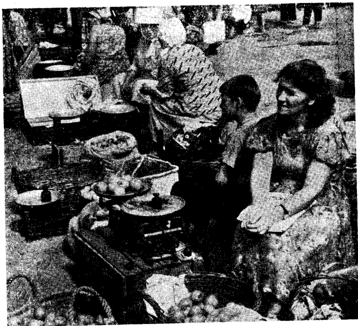
Free markets grow everywhere in the Soviet Union. This is a glimpse of a free market on the coast of the Black Sea.

rely on the supplies of the free markets for their non-staple food. Free market potatoes in some regions and cities make up 80 per cent of the local supplies, vegetables 70 per cent, eggs 50 per cent and meat 40 per cent.