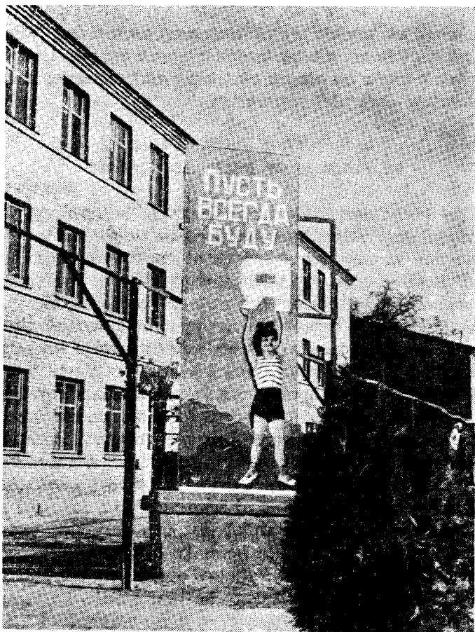
A poster erected in a school in the city of Zarkent in the Uzbek Soviet Socialist Republic. The Russian words say: "Let there always be 'I.'" It is an advertisement of the Soviet revisionist line with bourgeois "self" as its core.