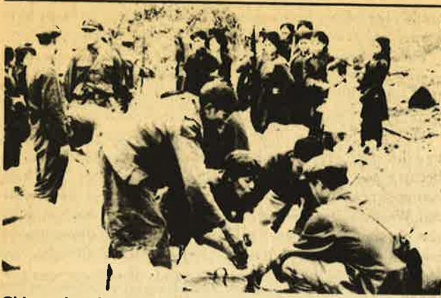
Chinese frontier troops distribute rice to Vietnamese inhabitants in Cao Bang area. The rice was given by China as aid to Viet Nam.

persecuting the Chinese of the south, business owners and non-owners alike. Mass raids and truckload roundups of Chinese took place.