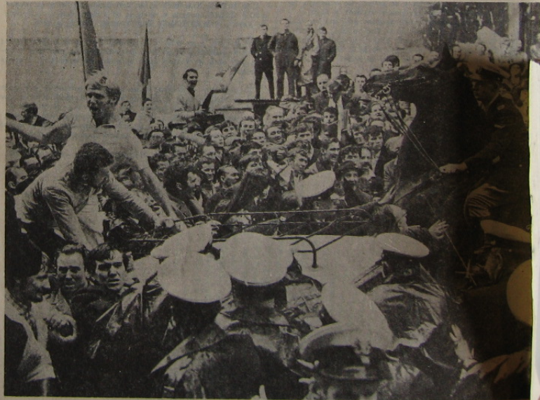
Workers battle police during 1969 Penol povers struggle: "The workers will lead the people to final victory."

This means that our fight for a society where people rule must be a fight for Australian independence. Of course genuine independence means freedom from foreign domination. The USSR, once a socialist country, has become an imperialist superpower, rivaling the United States in world domination. The Soviet leaders have their eyes on Australia and their agents are active here. On a global