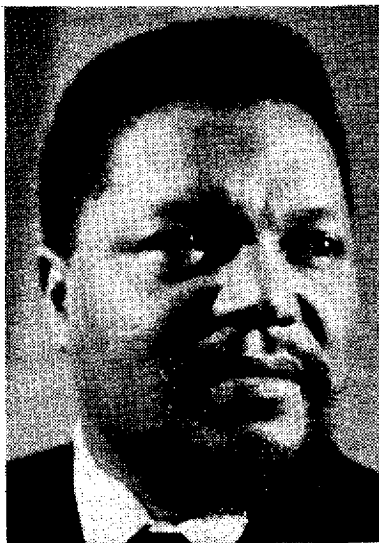
ROBERT FRANKLIN WILLIAMS- chairman-in-Exile of the Revolutionary Action Movement; Premier of the African- american government-in-exile.

Our message of the Black peoples of the world: UNITE or PERISH-WE WILL WIN.