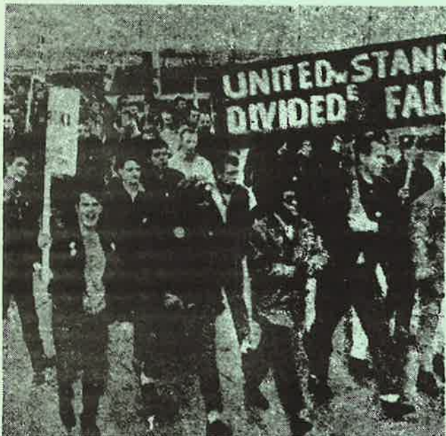
Six-mile solidarity march by Belvedere (Ill.) wildcatting strikers

The initial strategy of Ford and Reuther made this settlement almost inevitable. The UAW president picked Ford as the “target” company to lay the basis for follow-up contracts at