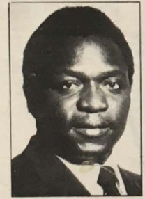
Mr Emmerson Mnangagwa