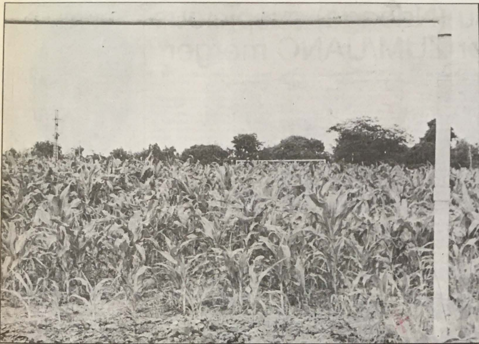
Marimba Primary School football pitch has been turned into a maize field. A councillor, it is alleged, took it upon himself to plant maize on the pitch. Marimba Primary is a council school.