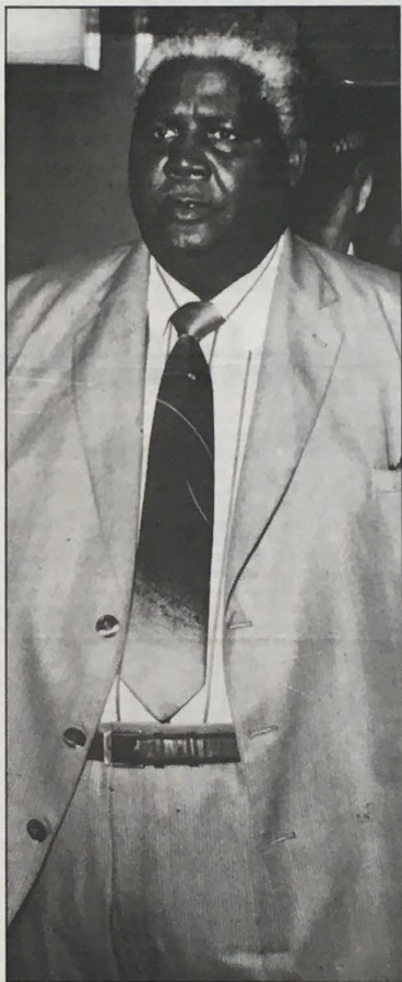
Dr Joshua Nkomo

"The old mutual had tendered $12 million which council could have invested yielding approximately $3 million a year for utilisation in other services needed by the community."