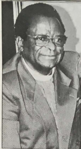
Bishop Abel Muzorewa

Mr Smith went further to say that no one opposed the idea of forming a united alliance. When asked whether the United Front would join the new ZUM or not, he said, this would require further discussion but he would prefer a new name for the alliance.