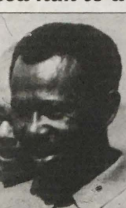
I have received a call to rescue my country... Mengistu.

Today Ethiopian people have no government nor even advocacy in the international arena. The so called Eritrean Peoples Liberation Front (EPLF) who have succeeded to separate Eritrea and the same rebel organisation. Both the TPLF and EPLF fought their own country Ethiopia for the last thirty years and are confusing the world by calling themselves with different names. The fact is, they are both one and single guerrilla organisation which emanates from one minority ethnic group — the Tigray tribe.