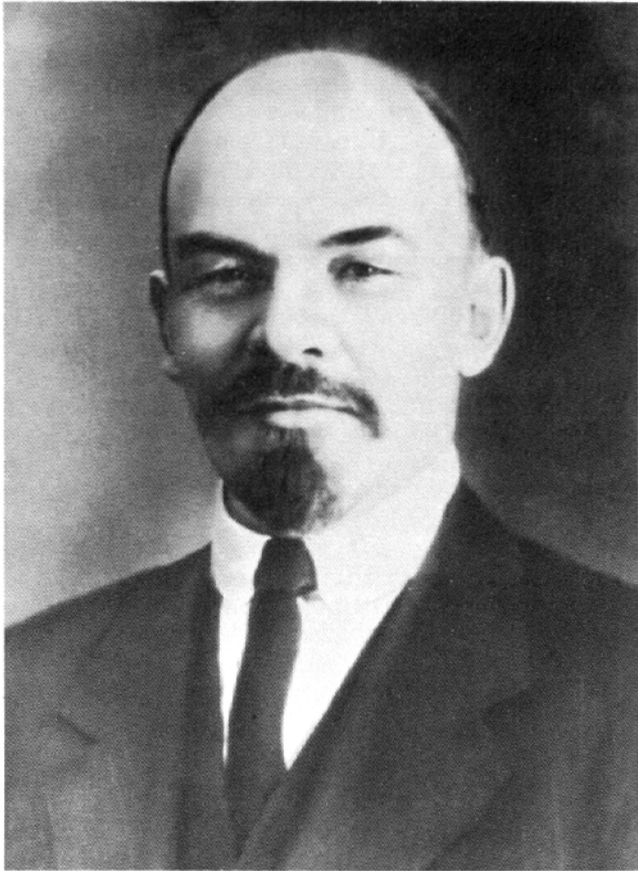
V. I. LENIN 1917