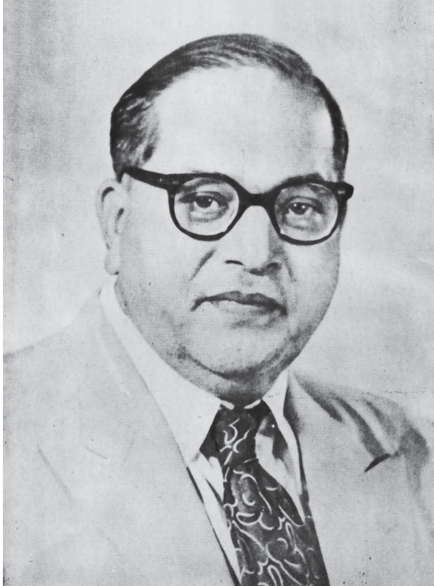
Babasaheb Dr. B.R. Ambedkar (14th April 1891 - 6th December 1956)